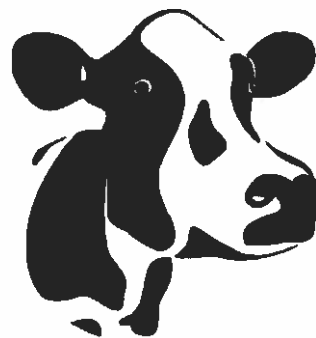
Animals and Farm Tours